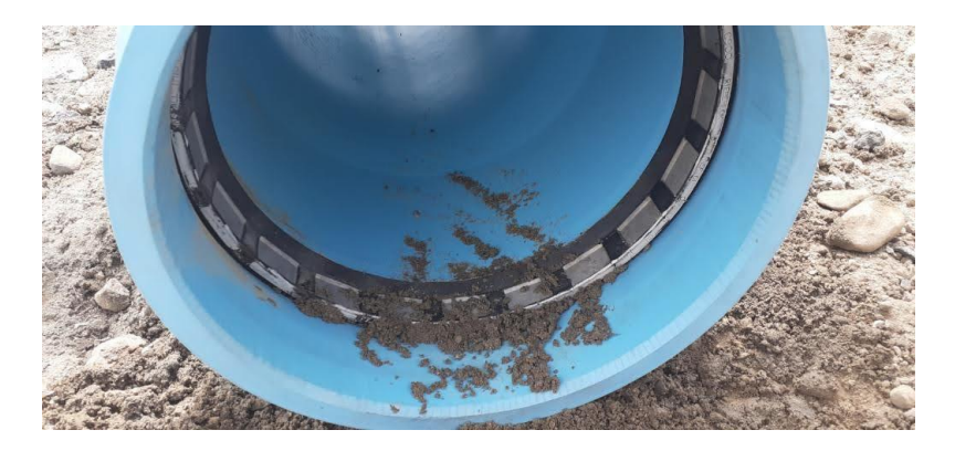
Figure 1: The sand and grit shown above must be cleaned from the restraint hardware. Dirty hardware may prevent the restraint mechanism from working and/or cause joint leak.

As with conventional bell-and-spigot pipe, the gasket and the groove area behind it should be wiped clean. If mud, dirt, silt, or other foreign material is in the sealing area, it may prevent the gasket from sealing against the spigot. In addition to cleaning the gasket area, the restraint hardware segments need to be clean. Debris in this area may prevent the hardware from engaging and keep the restraint mechanism from activating.