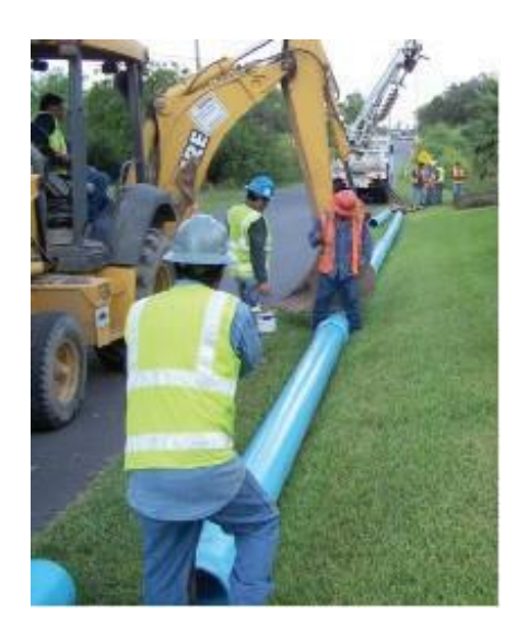
Figure 6: Example of an Eagle Loc joint assembly

NOTICE: AVOID OVER-STRESSING THE BELL (over-inserting the joints, or exceeding the maximum deflection/curvature allowed) IN ORDER TO PREVENT POSSIBLE BREAKAGE AND/OR LEAKS.