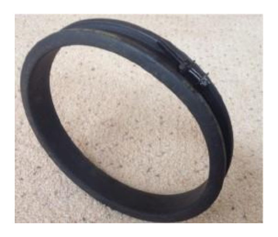
Figure 3: JM Eagle Insertion Stop

The Eagle Insertion Stop will greatly reduce the possibility of over insertion of the spigot into the bell when assembling PVC pipe.