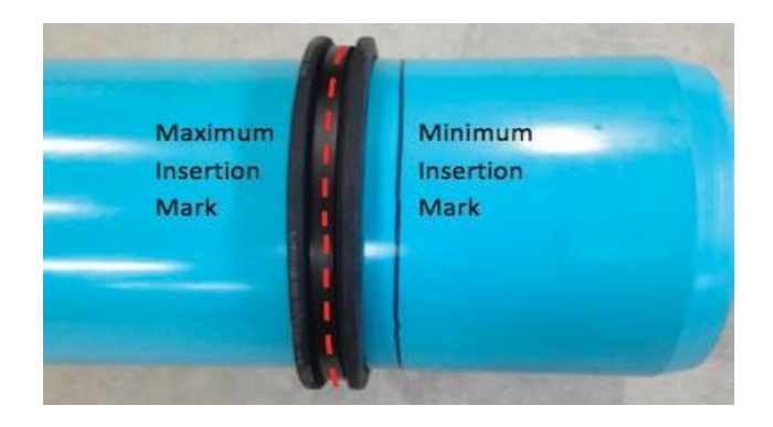
Figure 4: JM Eagle Insertion Stop Location

Ensure that the spigot is clean removing all dirt, dust, water, pipe lubrication, etc. Eagle Loc 900RL comes with two assembly mark lines on the spigot end of the pipe. These dual lines indicate the maximum and minimum depth of insertion of the spigot into the bell. The Insertion Stop should be placed centered on top of the assembly line furthest from the spigot (Ex. Dashed red line below).