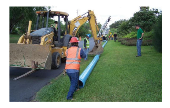
Figure 9: The backhoe's bucket center loads the previously installed length of pipe to keep it from moving while the new joint is being assembled