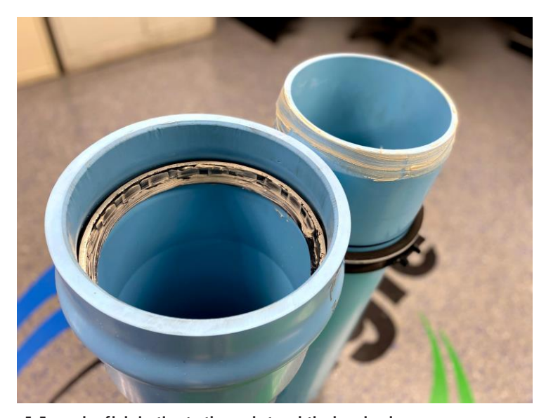
Figure 5: Example of lubrication to the gasket and the bevel only.

The lubricating technique is different from standard C900 pipe. Prior to assembly, apply lube to the gasket and bevel only ( DO NOT apply lube to the spigot barrel). Use only lubricant supplied or recommended by JM Eagle.