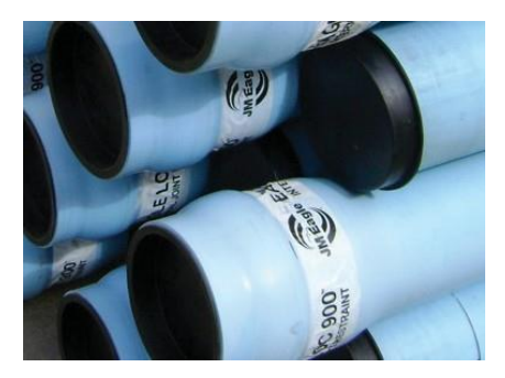
Figure 2: The end plugs in these pipes keep dirt and other foreign material out of the bell.

To make an easy installation even simpler, the product comes supplied with end plugs. The end plugs make it easier to keep the bell, gasket area, and restraint hardware clean. The plugs should be left in place until the joint is ready for assembly.