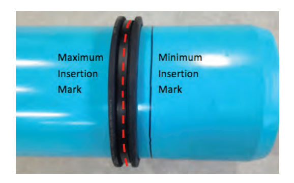
Figure 6: JM Eagle Insertion Stop Location

Ensure that the spigot is clean removing all dirt, dust, water, pipe lubrication, etc. Eagle Loc 900 comes with two assembly mark lines on the spigot end of the pipe. These dual lines indicate the maximum and minimum depth of insertion of the spigot into the bell. The Insertion Stop should be placed centered on top of the assembly line furthest from the spigot (Ex. Dashed red line below).