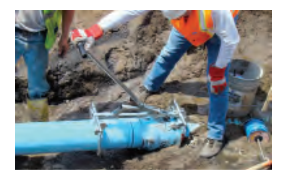
Figure 11: This assembly tool is called the Eagle Claw and is available from Pro Pipe Solutions.