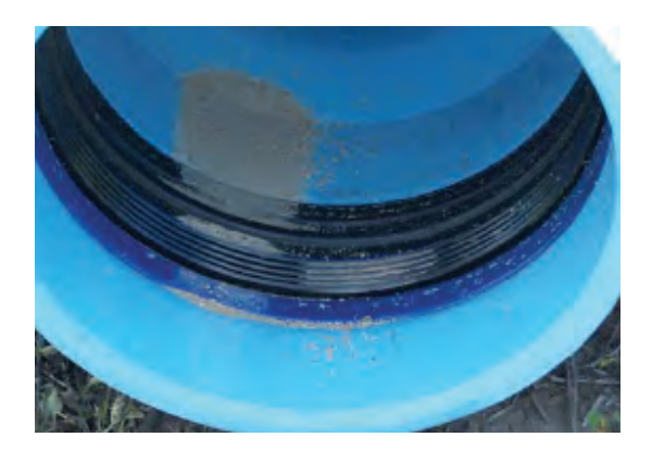
Figure 1: The sand and grit shown above must be cleaned from the restraint hardware. Dirty hardware may prevent the restraint mechanism from working.

As with conventional bell-and-spigot pipe, the gasket and the groove area behind it should be wiped clean. If mud, dirt, silt, or other foreign material is in the sealing area, it may prevent the gasket from sealing against the spigot. In addition to cleaning the gasket area, the restraint hardware needs to be clean. Debris in this area may prevent the hardware from engaging and keep the restraint mechanism from activating.