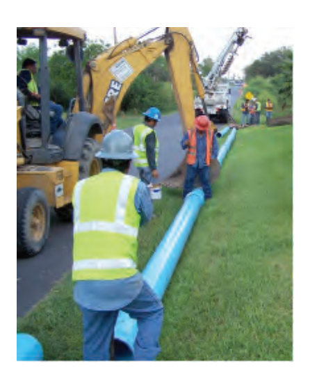
Figure 7: Example of an Eagle Loc joint assembly

To assemble, slide the spigot into the bell, maintaining straight alignment, until the bell contacts the insertion stop. Do not push the spigot farther into the bell as this reduces the rotational flexibility at the joint and causes unnecessary stress on the bell.