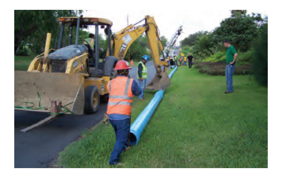
Figure 10: The backhoe's bucket center loads the previously installed length of pipe to keep it from moving while the new joint is being assembled