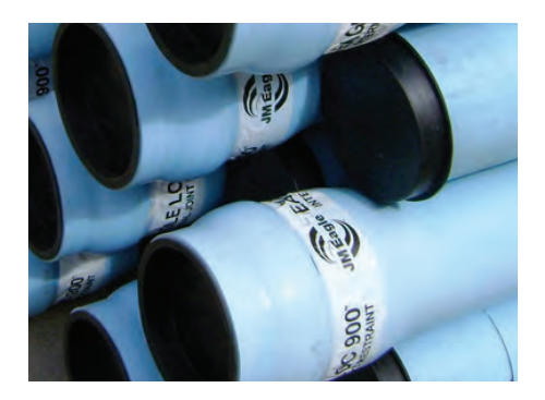
Figure 2: The end plugs in these pipes keep dirt and other foreign material out of the bell.

To make an easy installation even simpler, the product comes supplied with end plugs. The end plugs make it easier to keep the bell, gasket area, and restraint hardware clean. The plugs should be left in place as long as possible. Remove them just prior to assembling the joint.