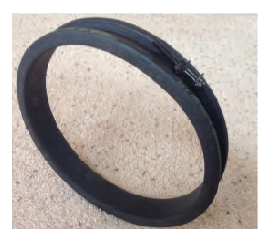
Figure 5: JM Eagle Insertion Stop

The Eagle Insertion Stop will greatly reduce the possibility of over insertion of the spigot into the bell when assembling PVC pipe.