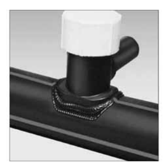
Figure F Correctly Made Saddle Fusion Joint